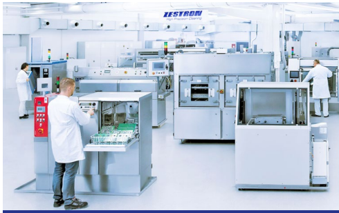
Machine Test Center